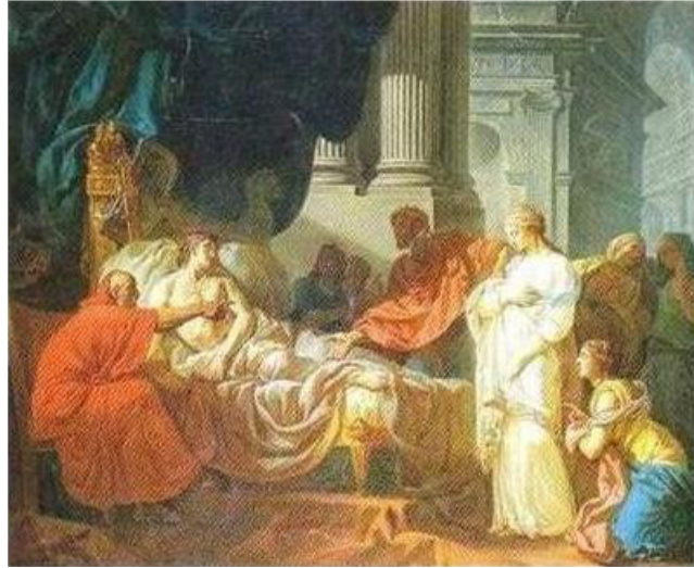
Figure 2. Erasistratus diagnosing the sickness of Antiochus as the result of his passion to Stratonice (his stepmother).

sources until the third century not one could give a clear and consequent account concerning the blood circulation.