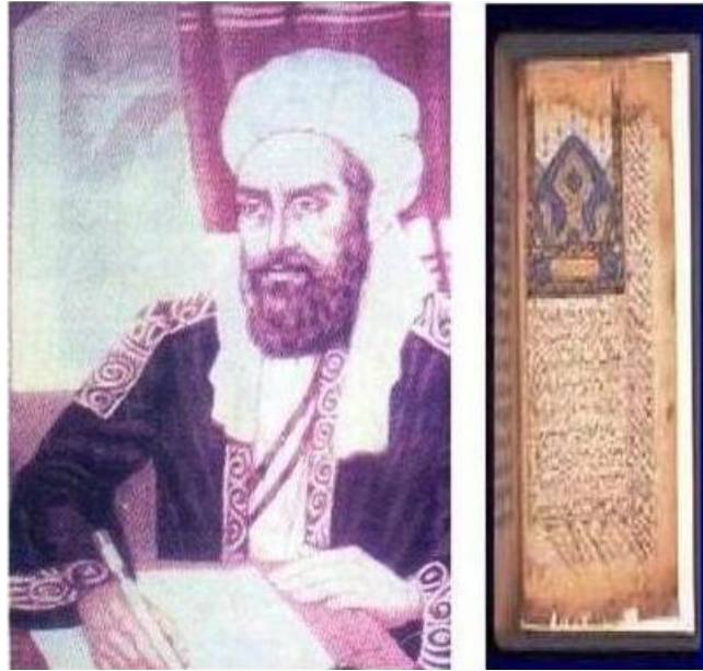
Figure 1. Ibn al- Nafis described the movement of blood through the pulmonary transit, explicitly stating that the blood in the right ventricle of the heart must reach the left ventricle by way of the lungs and not through a passage connecting the ventricles, as Galen had mentioned.

anatomist from Asia minor who, while working in Alexandria, pioneered the study of anatomy, and described the brain as a center of the nervous system and seat of intelligence 3 . He dissected the heart and found several cavities in it, also noted that by observing the pulse it was possible to evaluate the seriousness of diseases. (Figure 1)