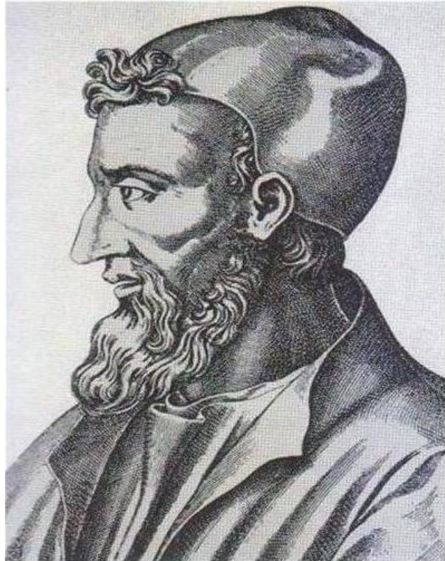
Figure 4. (131-201) who gave an incorrect description of the circulation of the blood.