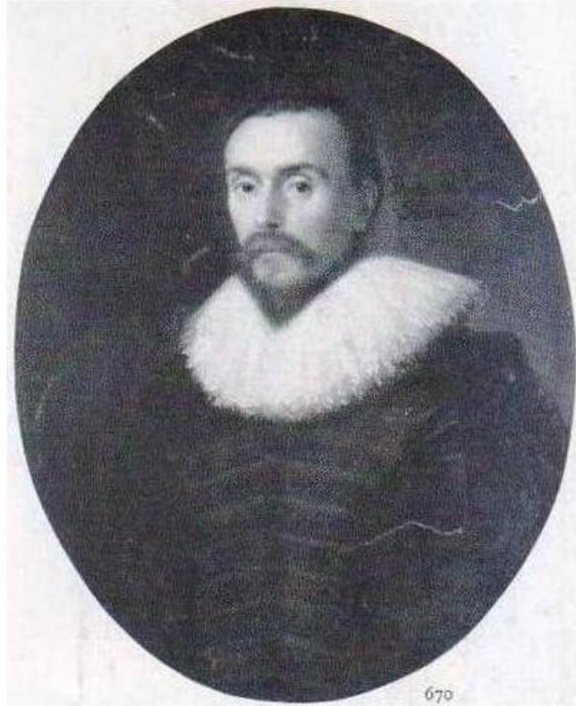
Figure 6. William Harvey. Of paramount importance was Harvey's discovery of the circulation of the blood which was published in 1628.

Heart and Blood in Animals") in Germany in 1628. In this important work, considered the greatest medical treatise of all time, William Harvey "detailed the flow of blood from the right side of heart through the lungs, into the left side of the heart, then through the arteries into the veins, and finally back into the right side of the heart." This argument required Harvey to take a bold deductive leap from the arteries into the veins, sine minute blood vessels (the capillaries), which carry blood from the arteries to the veins, could not actually be seen until the microscope had been perfected.